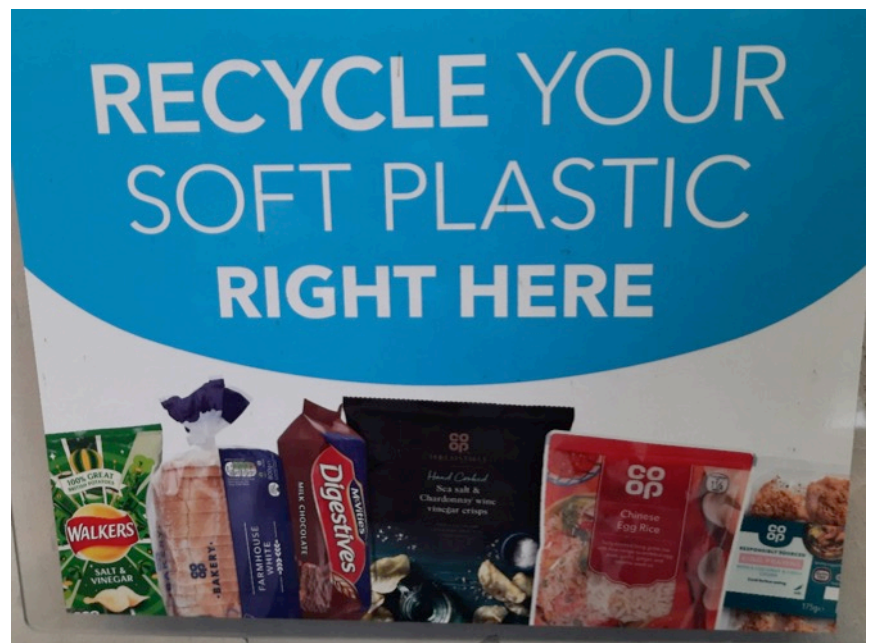
Recycling in the Co-Op (See p. 14)

Arthur's Seat from the south-western tip of St Margaret's Loch, Holyrood Park, Edinburgh. St Margaret's Loch was manmade in 1856 at a time when Prince Albert, Consort to Queen Victoria, was attempting to improve the surrounding area of Holyrood Palace.