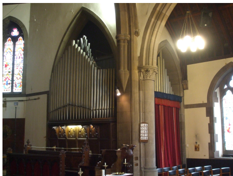
(The Casework of the Rushworth & Dreaper instrument, 1997)