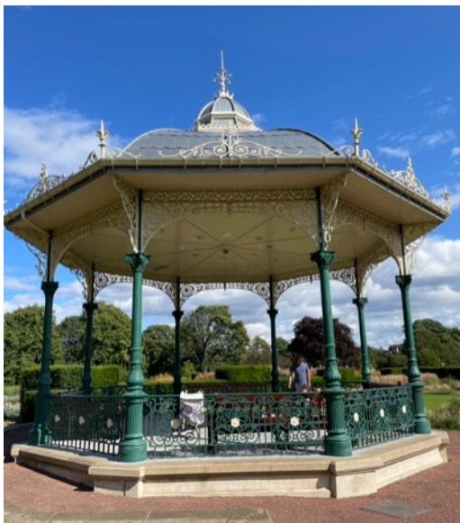
Saughton Park See walk on page 10 Band Stand Formal Garden