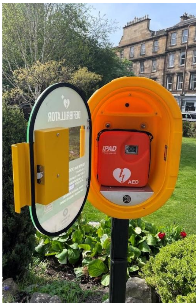
Inside the defibrillator pack.