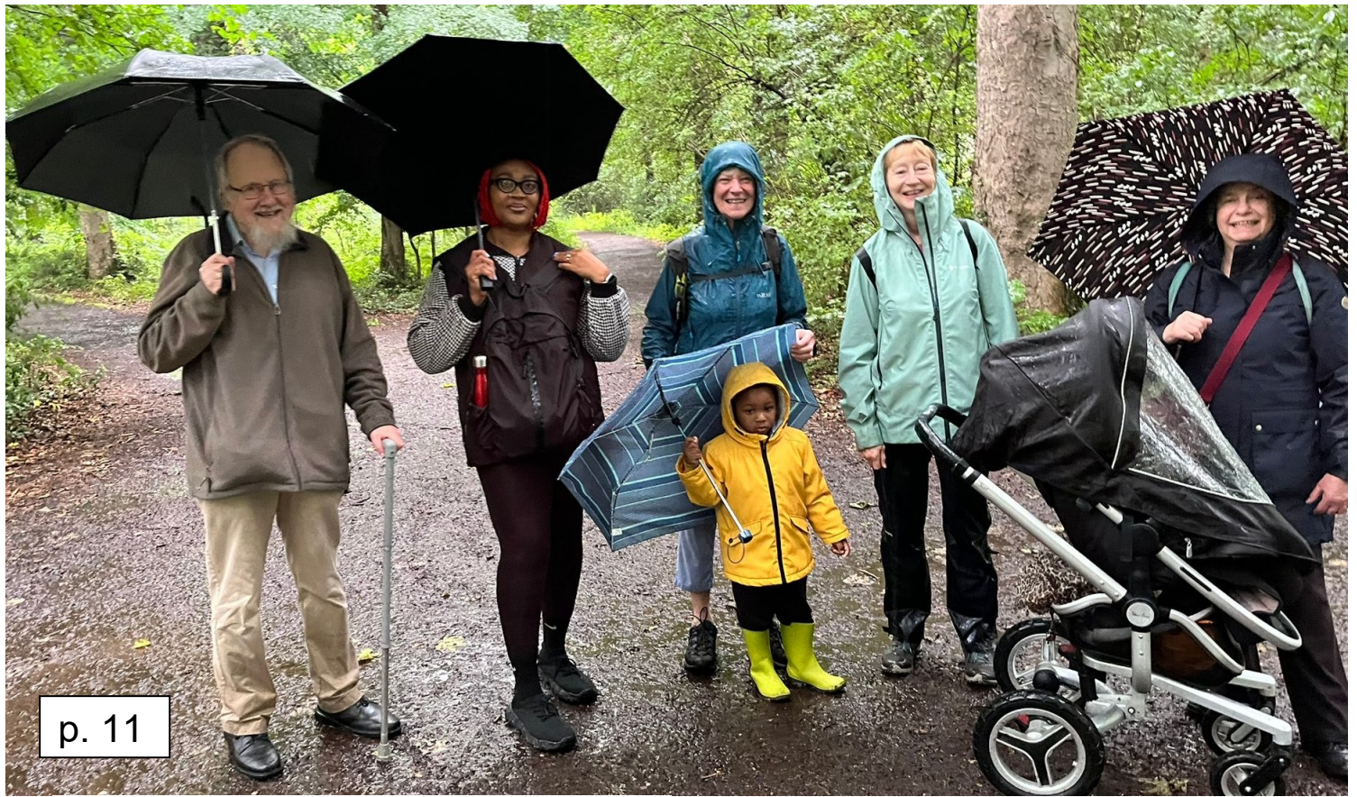
Above: In Dalkeith Country Park Below: Craigmillar Castle