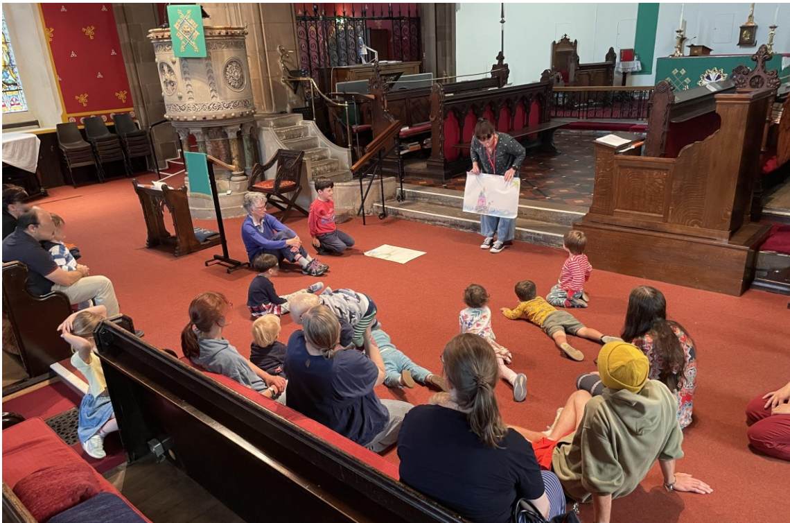
The Two House Builders.

Should the houses be built on sand or on rock??