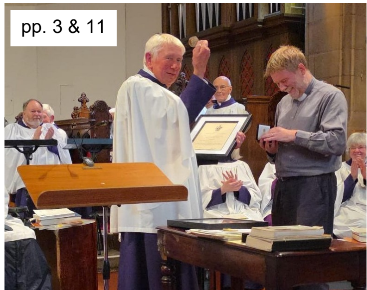
pp. 3 & 11