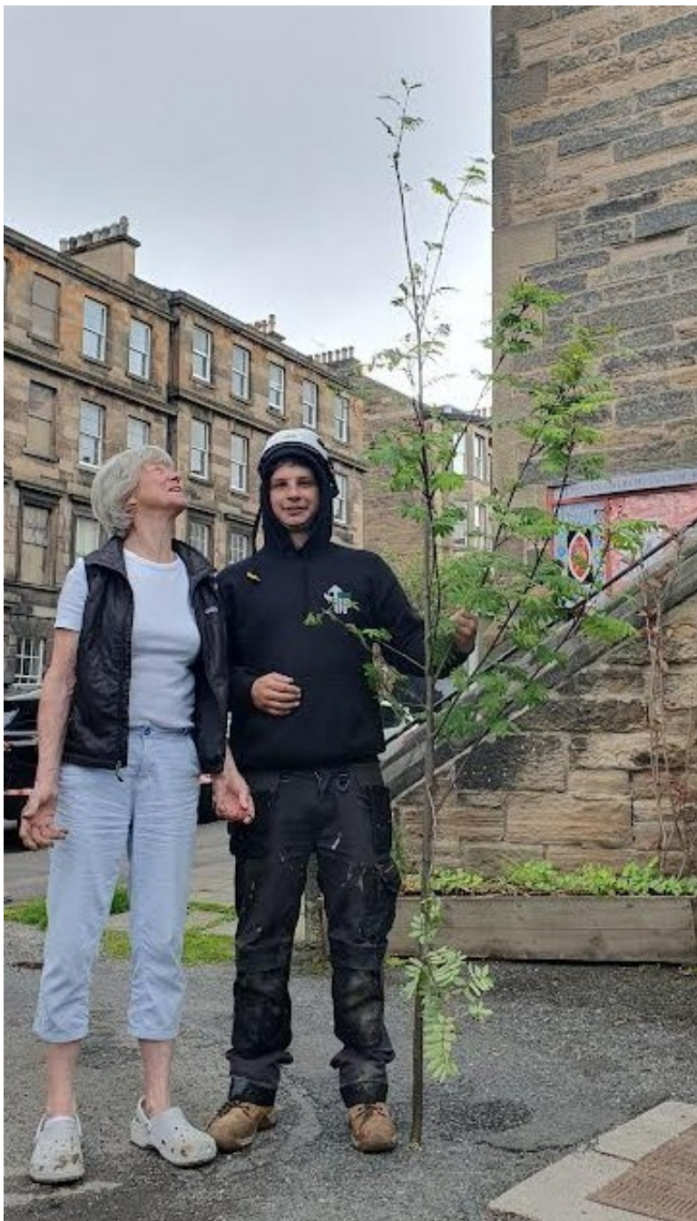
p. 17 Trees around the Tower! p. 16 Walk on 23 rd May